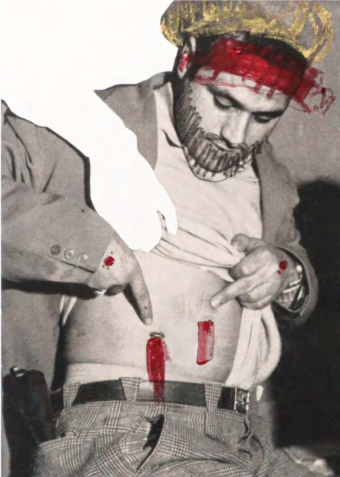
NATE SZARMACH Doubting Tommy , 2022 Mixed Media Collage on Panel 7 x 5" Framed: 10 x 8"