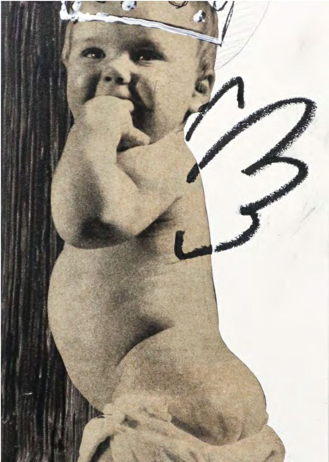
NATE SZARMACH Hard Bodies , 2022 Mixed Media Collage on Panel 7 x 5 " Framed: 10 x 8 "